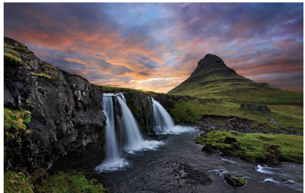
Mt. Kirkjufell