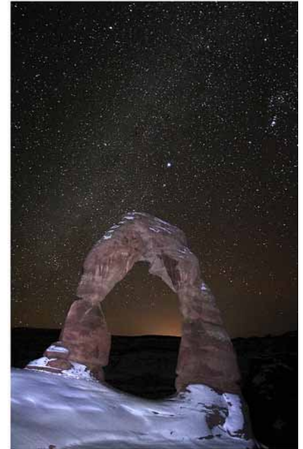
A Starry Night at Delicate Arch