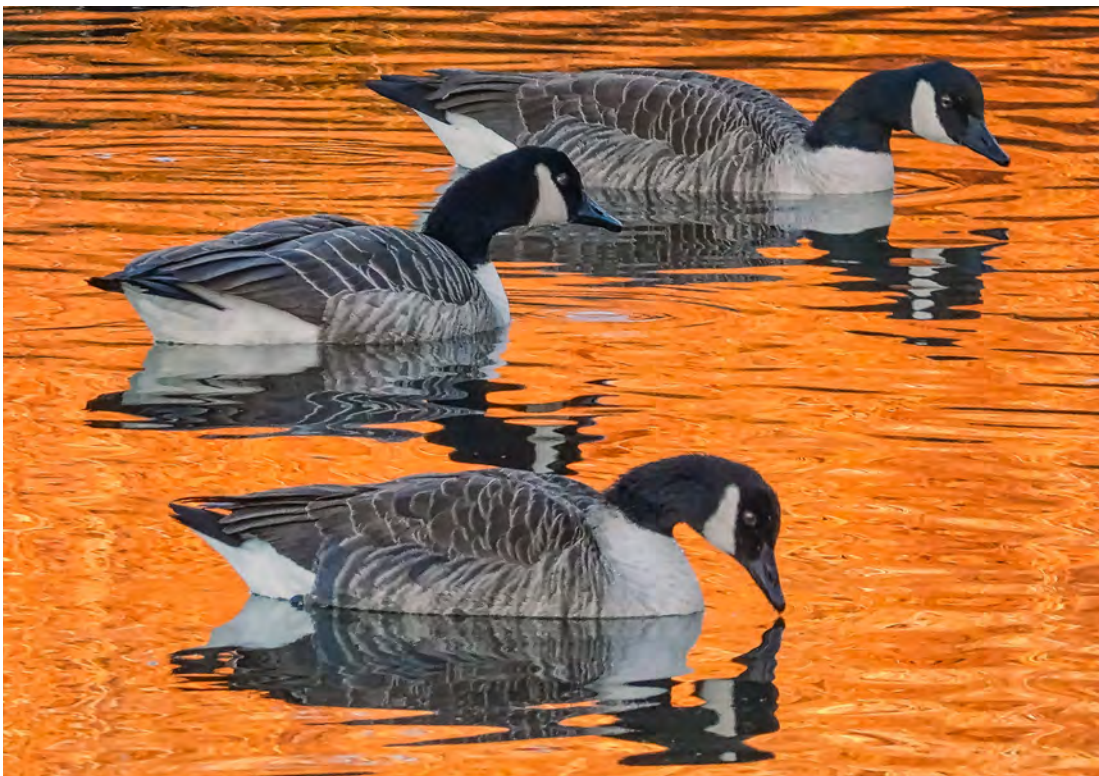
Canada Geese ©2021 Wm.D.King

Instagram: williamdkingphotography website: www.williamkingphotography.com