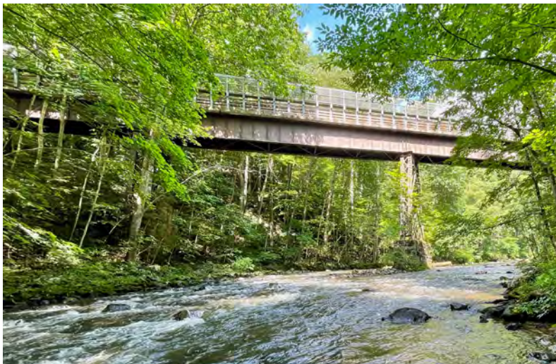
The Ken Lockwood Gorge Bridge crossing the South Branch Raritan River in Ken Lockwood Gorge in Lebanon Township, New Jersey.

Meet 11:30 am for car pick up. NYC return about 10:00 pm. For pick up location and to volunteer as a carpool driver, call Charles Dexter. See https://en.wikipedia.org/wiki/Ken_Lockwood_Gorge .