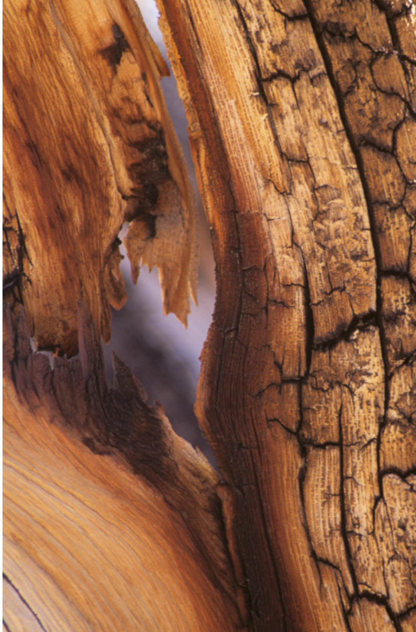
Wood Sculpture, Iceland, Lynne R. Cashman