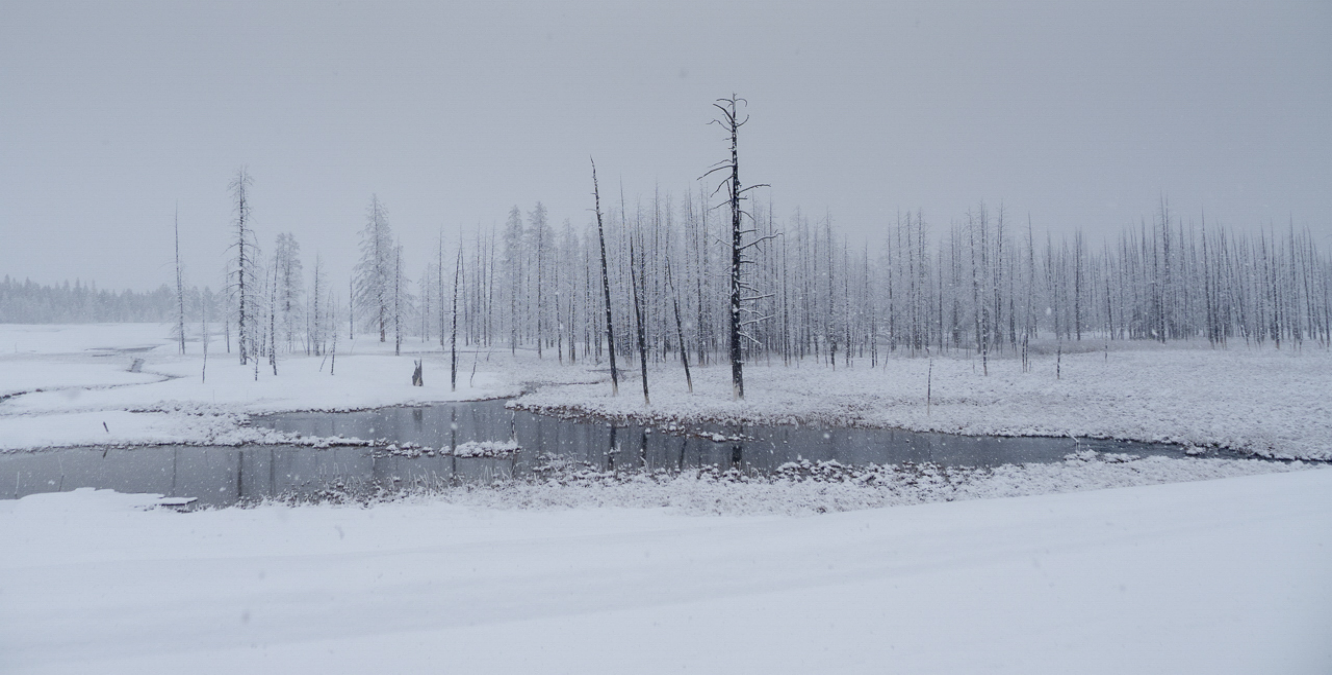
Yellowstone in Winter