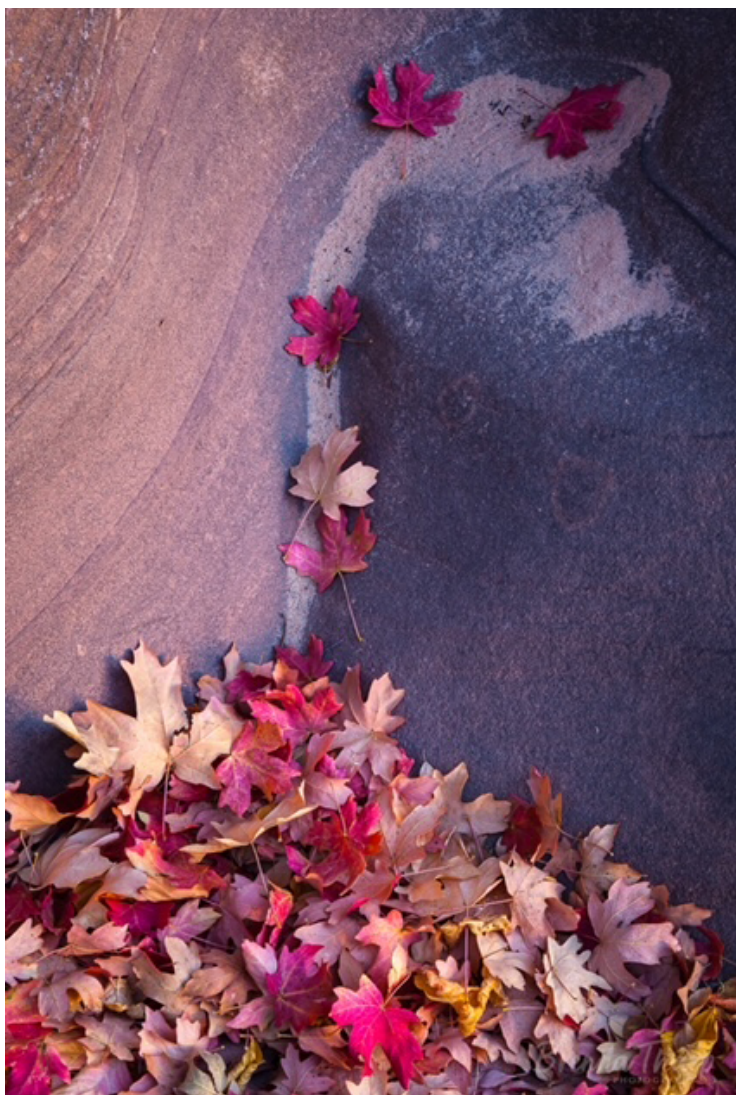
Brenda Tharp (Untitled)

Wednesday, March 27 (via Zoom only): Brenda Tharp